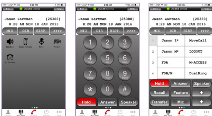
Audio Controls and Optional Features